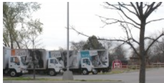
CCA trucks sit next to the new community garden which always needs volunteers

Whether you voted for him or not, one of the best things President Obama did in his early days in office is to remind us all in order to change the world, we first have to change ourselves and change starts right here at home.